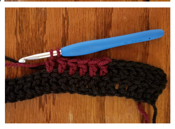
Row 6 & 7: carry up dark pink and light pink, repeat row 5

At the end of row 7, drop light pink and fasten off, carry up dark pink and join gray